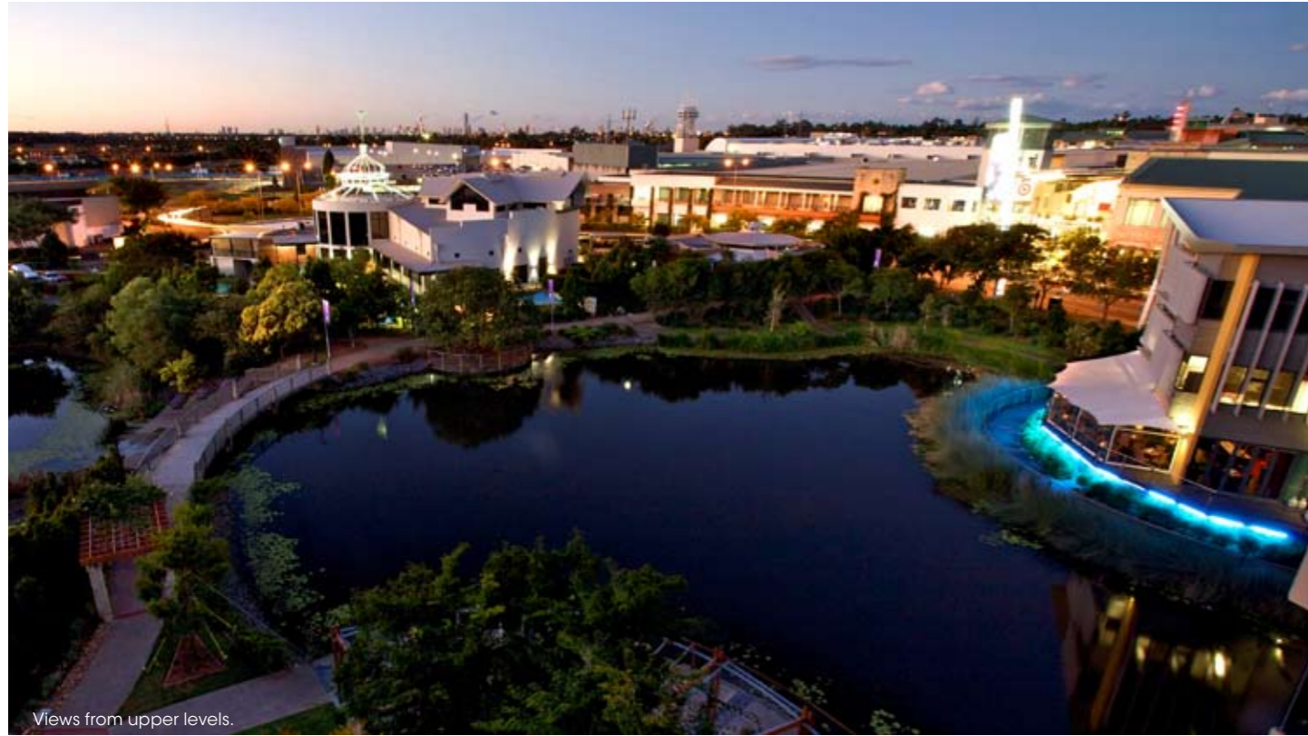
Views from upper levels.

City living. Robina Town Centre style. Only one location gives you both.